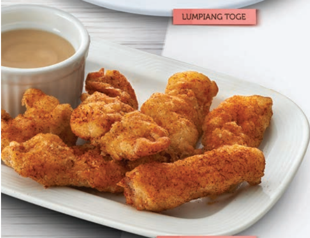
SPICY CHICKEN FINGERS