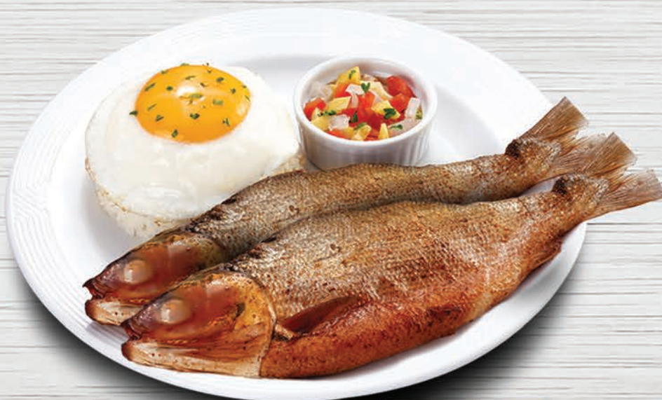
SMOKED GOLDEN TINAPA