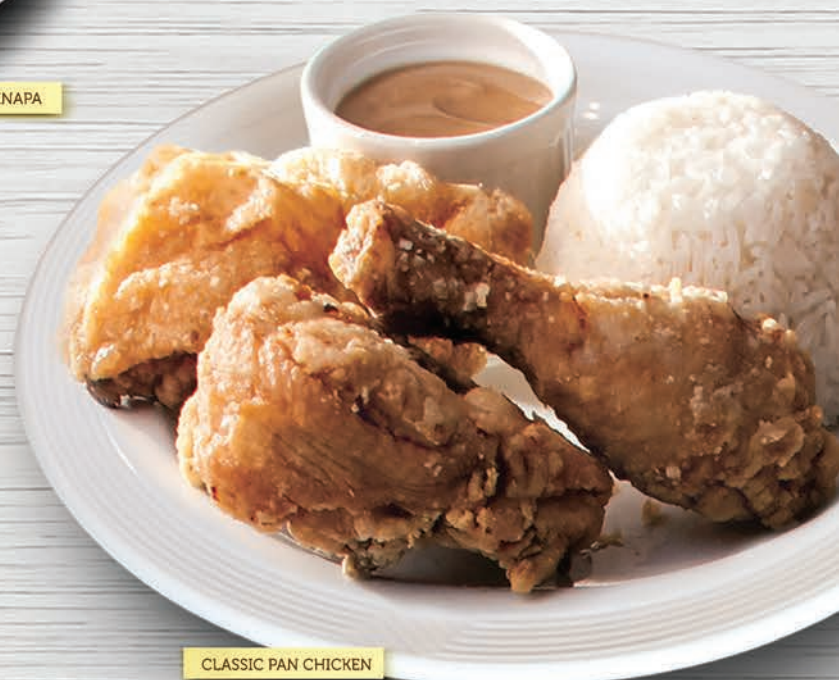
CLASSIC PAN CHICKEN

Our popular and well-loved crispy and succulent chicken served with flavorful homemade gravy. (2 pcs) 25 (3 pcs) 32